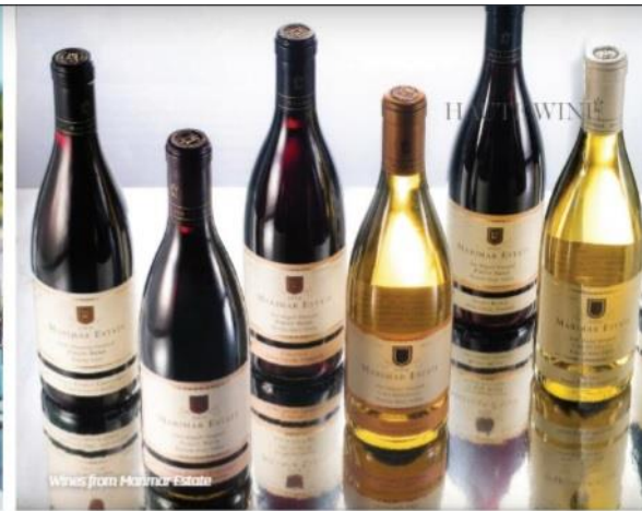
Wines from Marimar Estate

about my home, and he sent over items from Catalonia: bed, bedcovers, cabinets, tables. I have loved being able to bring my Spanish heritage here to my California winery and home. This is also why I wrote several books about Catalanian food, wine, and culture.