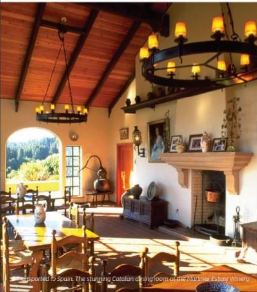
Imported to Spain. The stunning Catalan dining room at the Marimar Estate Winery