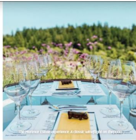
The Marimar Estate experience. A classic table set on the patio