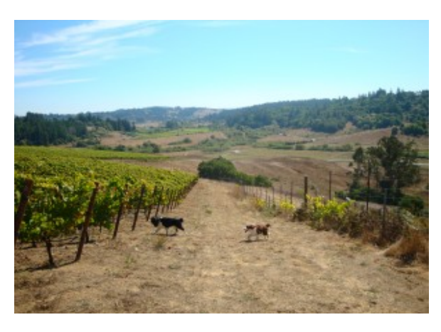
CHICO AND BONITA LOVE RUNNING AND PLAYING AROUND IN THE DOÑA MARGARITA VINEYARD!