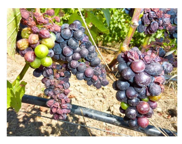
A WORST-CASE-SCENARIO IN PINOT NOIR: GREEN AND SUNBURNED BERRIES IN THE SAME CLUSTER!