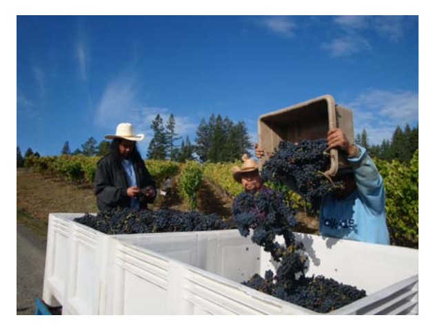
THE FIRST PINOT GRAPES CAME IN ON SEPTEMBER 26 -- JUST ABOUT A MONTH LATER THAN NORMAL!